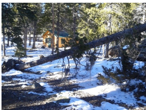
Up by the Kiwanis Lodge, a couple remnants. Left is just one of many trees blown down in another micro-burst at camp. Right is what's left of some Scouts' snow cave for a campout.