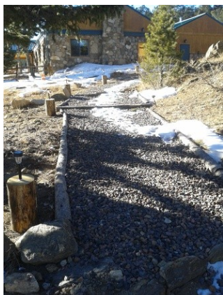
New walkway (left) between Campaster's cabin and the Trading Post.

Went up to camp in December to deliver the winter edition of the Tahosa Totem . Had the chance to take a few photos of camp upgrades and wind damage for this issue.