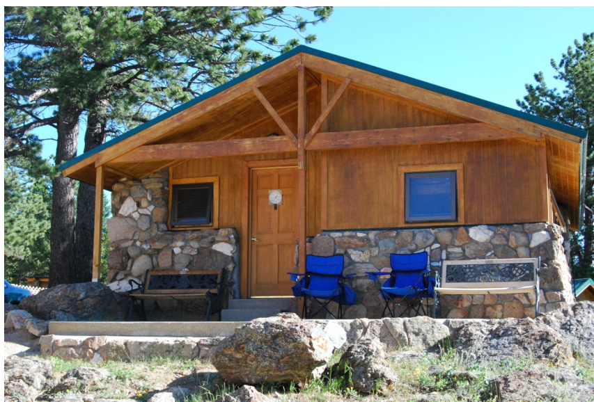
Camp Tahosa Campmaster Cabin.

Be sure to check the Tahosa.org calendar for Campmaster weekend availabilities.