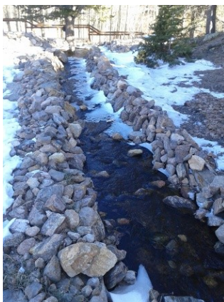
Replaced spillway (left) and receiving pools (right). Much more attractive than the old cement trough