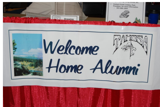
And so it was at the 2014 Scout Show entry table.