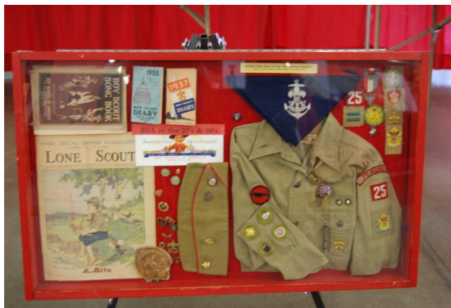
One of the several Scout Museum traveling displays brought to Scout Show.