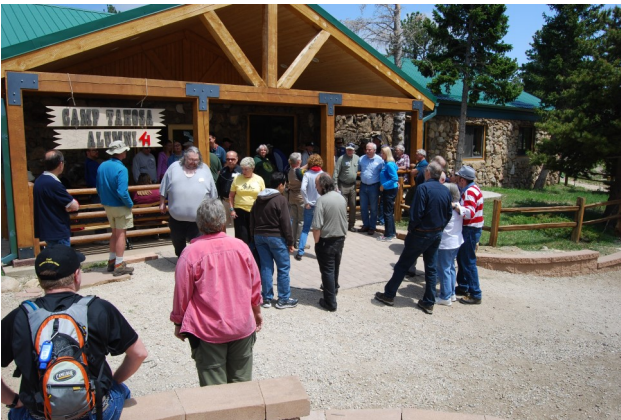
Gathered outside the Dining Hall, everyone enjoyed the lovely June weather.