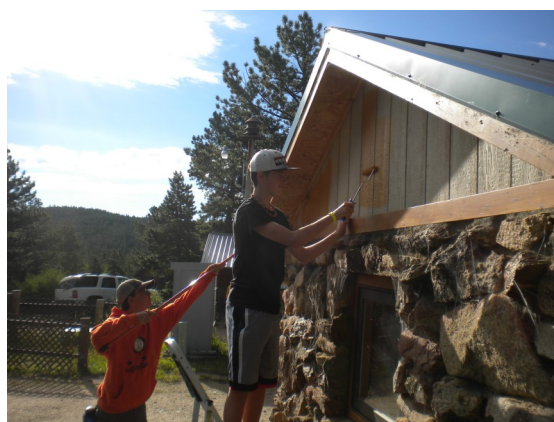
Members of OA Clan 9 providing cheerful service.