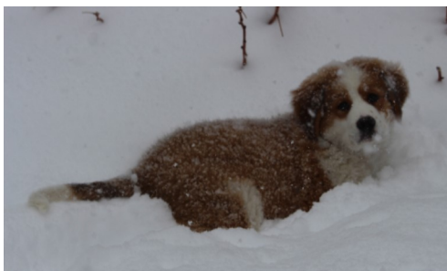
This editor loves Bernese Mountain Dogs and thinks Kuma is a fantastic addition to the Tahosa family—cutest little guy ever!