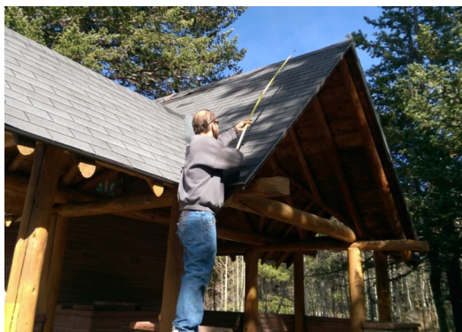
Scott Elzas, board member nominee and a bit sprier member, jumping up to measure the Chapel roof